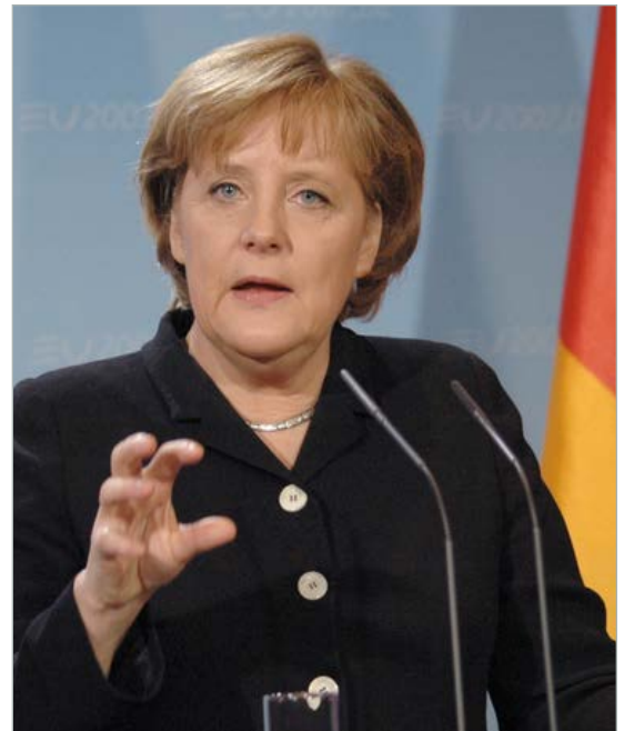
Angela Merkel, then the German chancellor, delivered a well-received commencement address at Harvard University in 2019.

"Therefore, we can and must do everything humanly possible to truly master this challenge to humankind," she remarked. "It's still possible. However, each and every one of us must play our part."