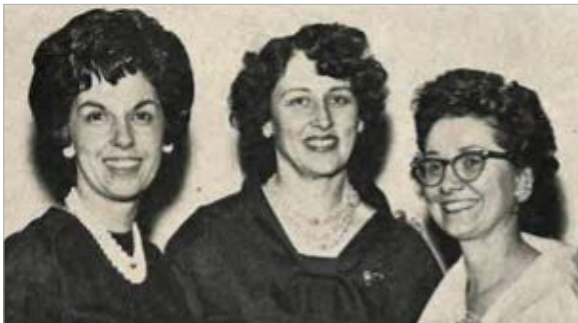
Winners of the 1963 Toastmistress Speech Contest