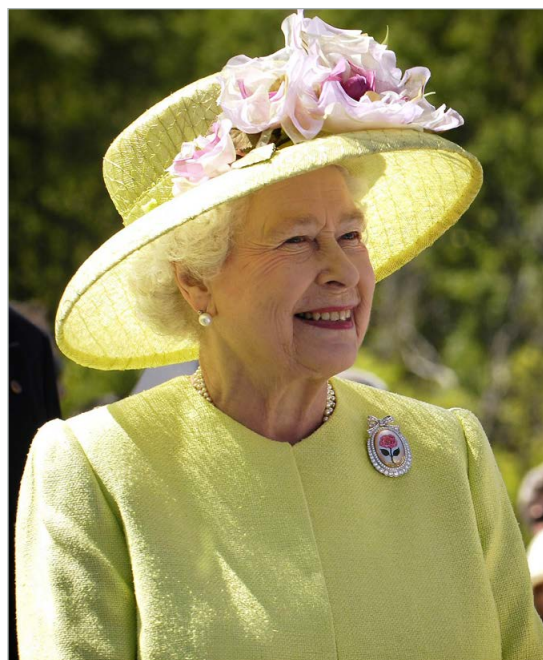
Queen Elizabeth II spoke about Princess Diana's death in a 1997 address.

Thus, Elizabeth acknowledged her familial and public relationships. Her use of humility and feeling echo the work of groundbreaking social theorist Carol Gilligan and others regarding the differing tendencies toward empathy and relationships between women and men. (Gilligan maintained that women prioritize an "ethics of care" revolving around interpersonal relationships, while men's moral code is tied more to an "ethics of justice.")