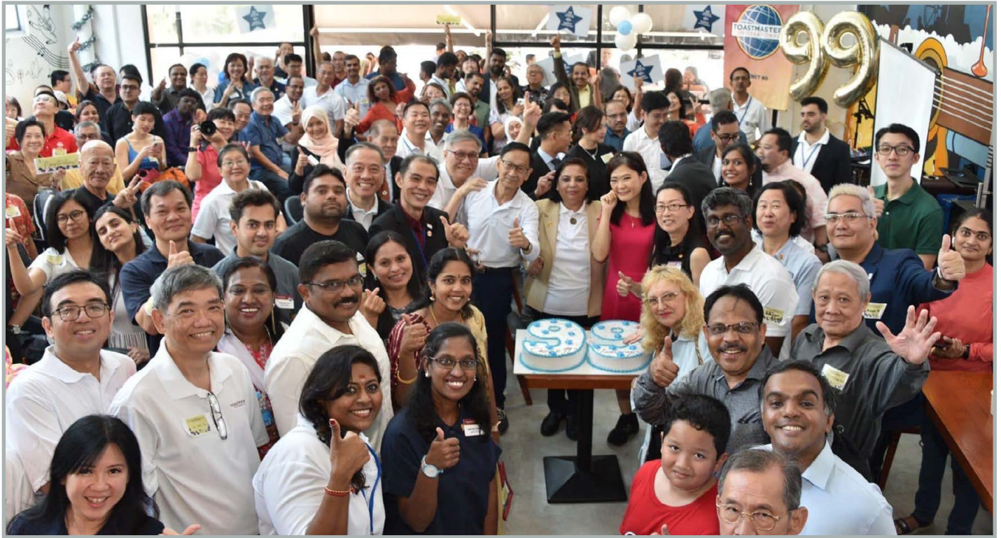
Over 100 members of District 80 (Singapore) gather to celebrate Toastmasters International's 99th anniversary in October 2023. The celebration also included recognizing club renewals and member achievements.